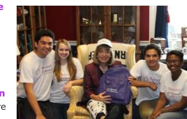
Our Teen leaders with Congresswoman Jackie Speier